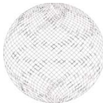
Orbitor 4 nozzle spray pattern