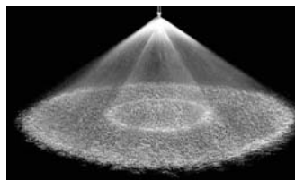
Full Cone 120° (W)