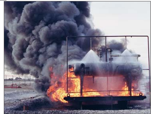
N6 nozzles protect a propane storage tank from fire and explosion.