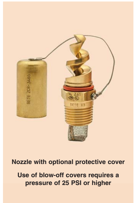
Nozzle with optional protective cover

Use of blow-off covers requires a pressure of 25 PSI or higher