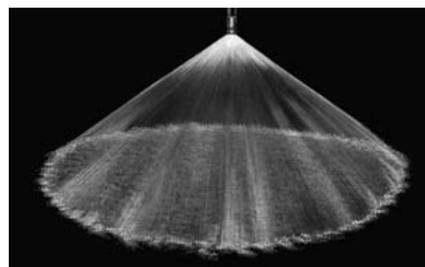
Full Cone 120°