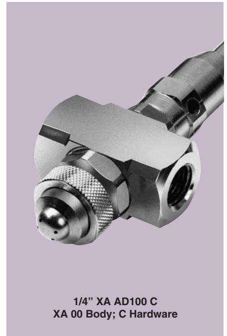
1/4" XA AD100 C XA 00 Body; C Hardware

Dimensions are approximate. Check with BETE for critical dimension applications.