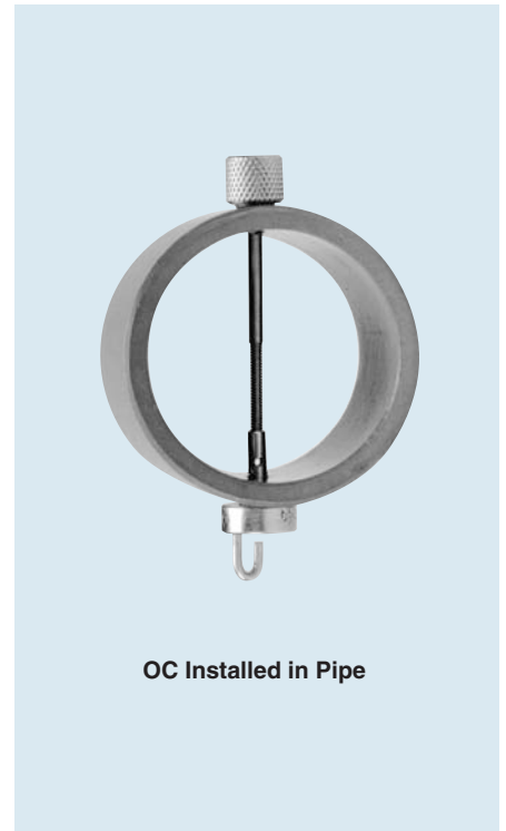
OC Installed in Pipe