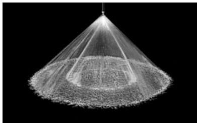
Full Cone 90° (XPN)