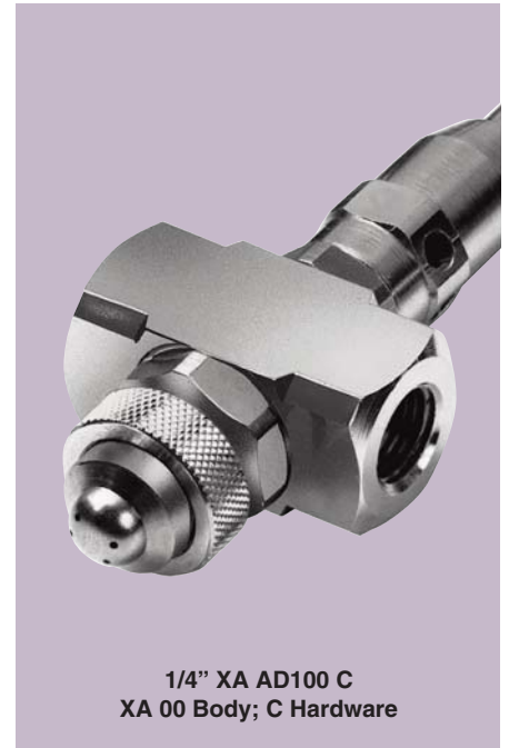
1/4" XA AD100 C XA 00 Body; C Hardware

Dimensions are approximate. Check with BETE for critical dimension applications.