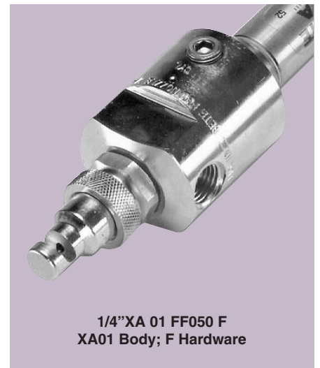
1/4"XA 01 FF050 F XA01 Body; F Hardware