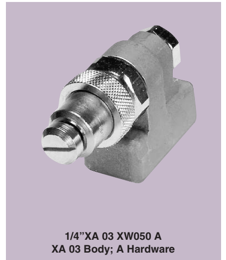
1/4"XA 03 XW050 A XA 03 Body; A Hardware