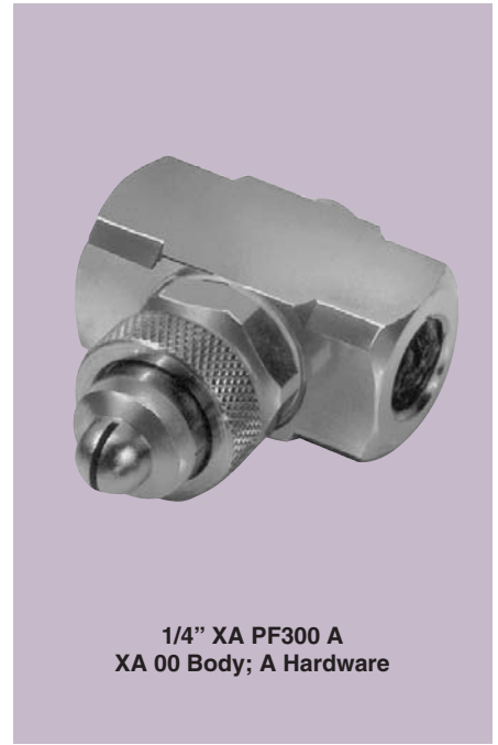
1/4" XA PF300 A XA 00 Body; A Hardware

Dimensions are approximate. Check with BETE for critical dimension applications.