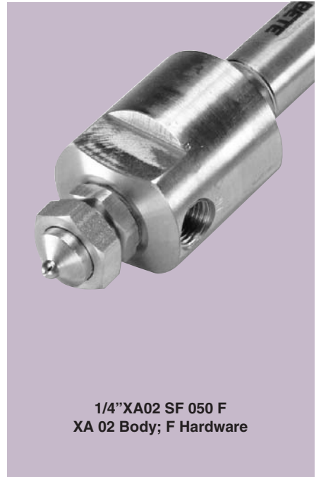
1/4" XA02 SF 050 F XA 02 Body; F Hardware

Spray angle performance varies with pressure. Contact BETE for specific data on critical applications.