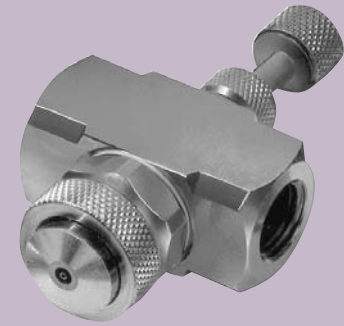
1/4"XA SR 200 B XA 00 Body; B Hardware

Dimensions are approximate. Check with BETE for critical dimension applications.