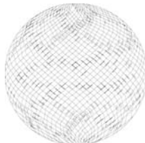
Orbitor 4 nozzle spray pattern