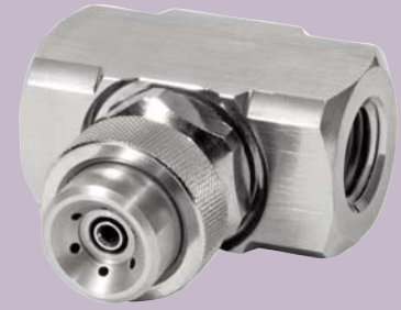
1/4" XAER850A XA 00 Body; A Hardware

Dimensions are approximate. Check with BETE for critical dimension applications.