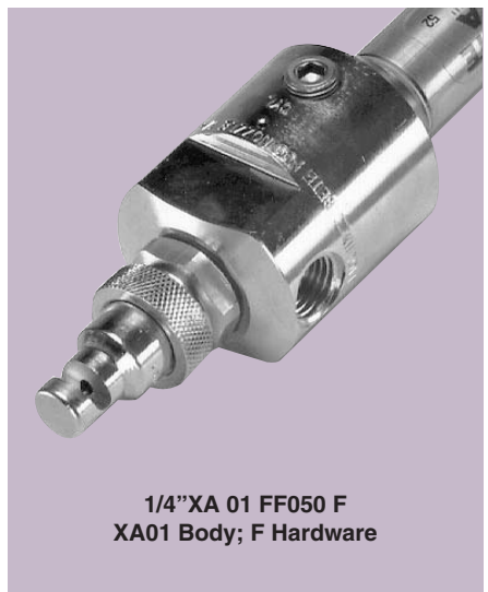
1/4"XA 01 FF050 F XA01 Body; F Hardware