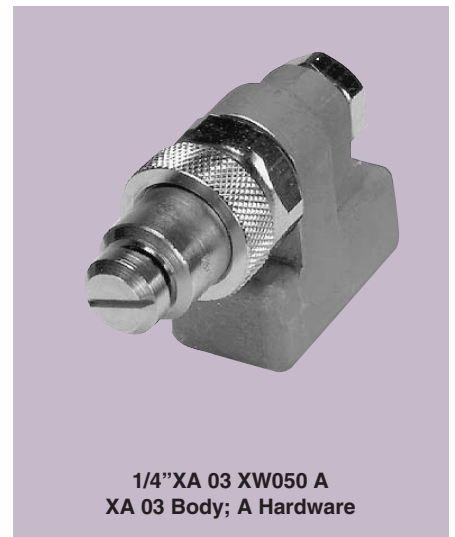
1/4"XA 03 XW050 A XA 03 Body; A Hardware