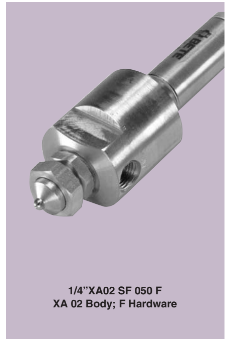
1/4"XA02 SF 050 F XA 02 Body; F Hardware

Dimensions are approximate. Check with BETE for critical dimension applications.